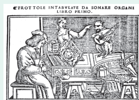
This page woodcut of Ferruccio Andreatta da sono Organ, the earliest printed source of Italian keyboard music, (London: British Museum 1575), illustrating the early lute-like structure of the harpsichord and the distinctive front-board and bearing frame of the new keyboard.

Balli per Cembalo 90 keyboard pieces from early Italian manuscripts edited by Christopher Hogwood